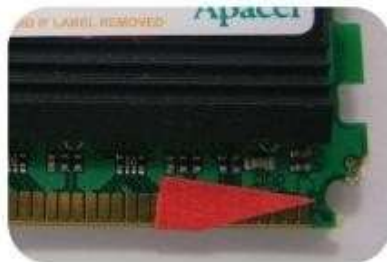
PCB Casing Damaged