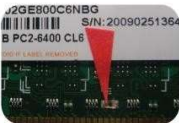
Resister Fall Off